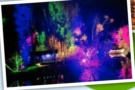
The photo of a colourful winter holiday in Devon was sent in by Tina. aged 11 who lives in Woolstone.

Until next time. Have a fun!!!! Cllr Penny .