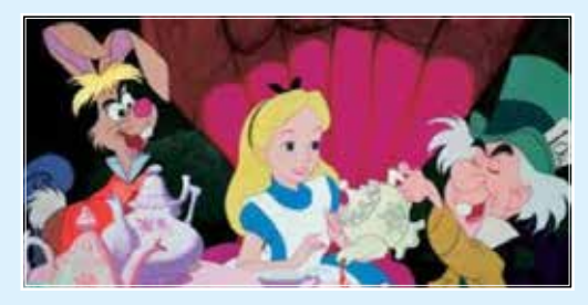
This is The Mad Hatter and Alice.

There will be a prize for the best Fancy Dress. We encourage you to come along on Alice in Wonderland themed fancy dress. Maybe you could be Alice, the Mad Hatter, the white rabbit, the cheshire cat or the Queen of Hearts.