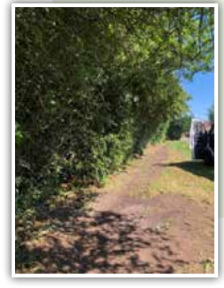
Footpath clearance at Willen

The resident was very surprised and pleased that the Landscape Team had completed the work so quickly.