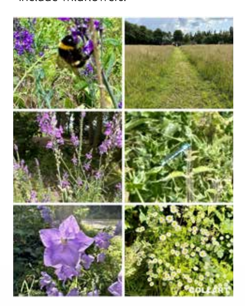
WILDLIFE SPOTTED IN OUR WILD AREAS

For the last couple of years, we have been leaving wild areas to increase biodiversity across our sites. This year starting with Oldbrook Green and Woolstone Green we are beginning to evolve these areas to include wildflowers.