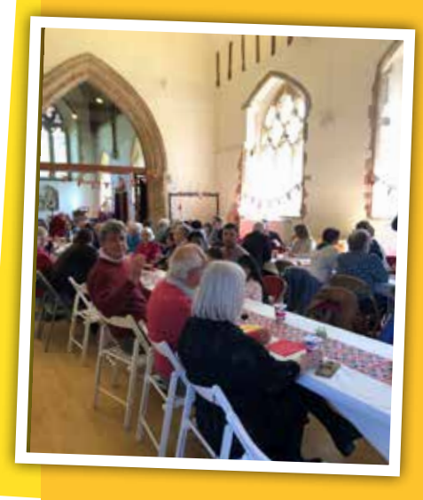
- Woolstone event -

or contact the Community Officer at the Parish office on 01908 608559