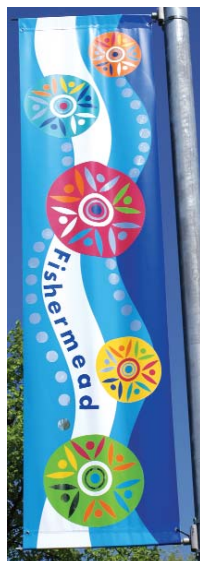
Above: remember 'On the Verge' in '08 – when local people worked with artists to express their estates' identities?

"It includes a safety surface, log fort, tyre swing and several other items. We hope the children will have lots of healthy fun with it for years to come."