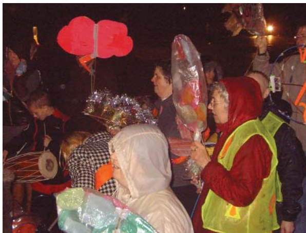
Above: happy people taking part in 'Glow in the dark' (see page 2). The event was a by-product of the Fishermead regeneration project (page 5) which is intended to help shape the future of that estate. It is important that local people take the opportunity to have their views heard.

● CPPC and the Parks Trust have been consulting Woolstone residents about the possibilities of updating the green area beside the Cross Keys Public House to a village green.