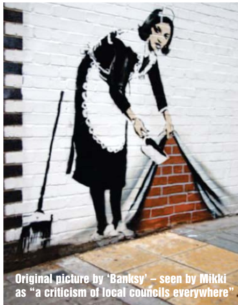
Original picture by 'Banksy' – seen by Mikki as “a criticism of local councils everywhere”